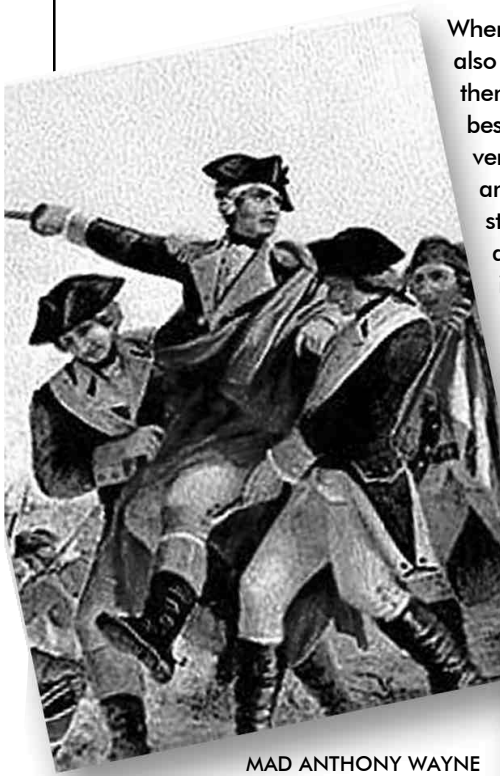
MAD ANTHONY WAYNE

American Revolution. He would have told the tiny remnants of his once mighty nation how they had swept across what is now the United States from west to east. His people had sold Manhattan Island to the Dutch. He probably had personally fought in the bloody French and Indian war in which his people tried to hold on to their territory around Fort Pitt. He might have conducted raids on frontier settlers. Because some of his people had sided with Britain in the American Revolution, they lost their lands in the east and were forced to move all the way back into what is now Ohio and Indiana. They then won two major battles defending their lands in Ohio being sold by land companies. They were finally defeated by "Mad" Anthony Wayne. Only a tiny handful of his people survived the mass starvation following this defeat. They allied themselves with the Miami who had a treaty which guaranteed their rights to this area of Indiana Territory forever. This is when they settled on Indian Creek where we now live. His people cooperated with and helped the early settlers in Lawrence Township in every way. The fur market collapsed and the Indians weren't needed as a cheap labor force. All Indian people were then surplus by the "Indian Removal Act" passed by Andrew Jackson. All treaties were violated and his people were forced to leave their homes and move west of the Mississippi River. The silent message the departing Indians left behind for all of us will be part of the next installment